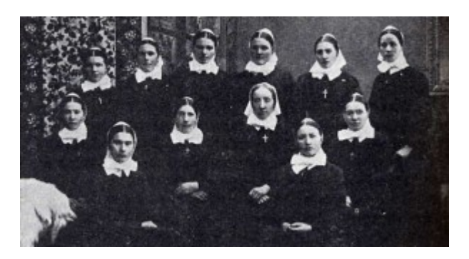
Norwegian deaconess nurse pupils, 1895

In February 2017 all nurses and other in Europe interested in the history of nursing, will get an invitation to participate in the MOOC "European Traditions and History.