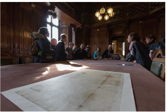
Europe. The visit to the archive of the IRCCS Founda-

Milan, with its artistic works and ancient buildings, celebrated the annual meeting of the European Association for the History of Nursing (EAHN). In February 2016, the Nursing History Group of Italian Nurses' Association, CNAI, with the collaboration of the Nurses Council of Milan, Lodi, Monza and Brianza hosted our group of experienced representatives of nursing history from